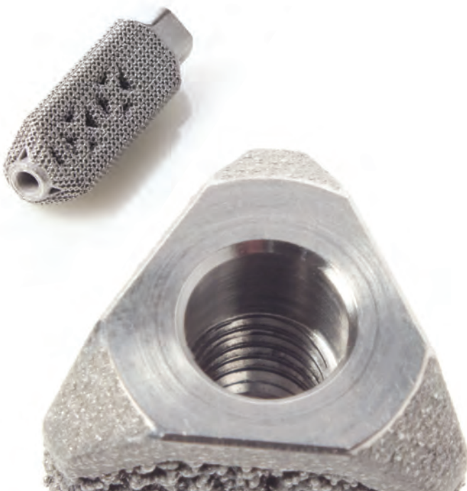
Printed spinal fusion cage