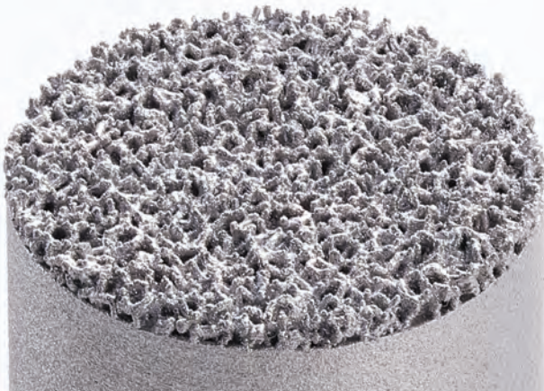
Secondary machining of printed implants